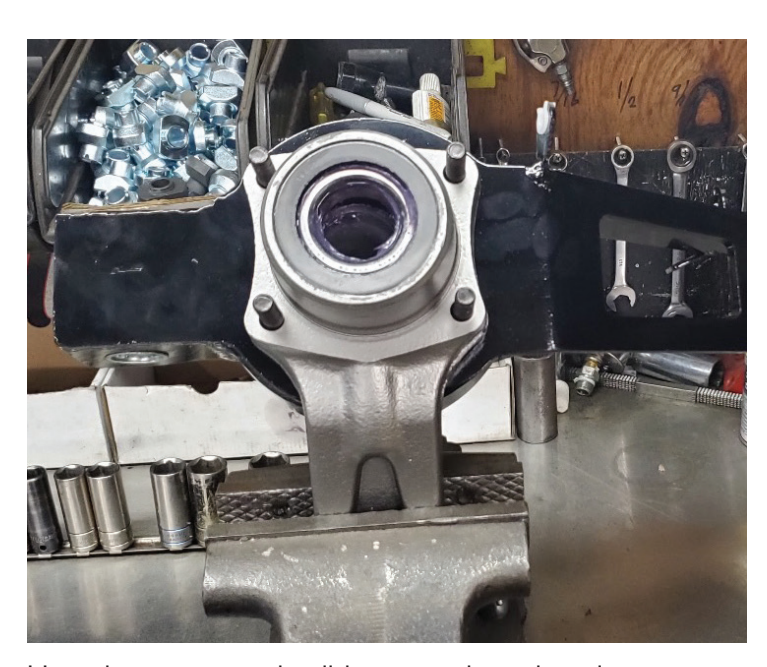
How the t-arm studs slide onto a bare bearing support.

These cars are 25 plus years old and the shock brackets could have been mounted at +/- the mounting point.