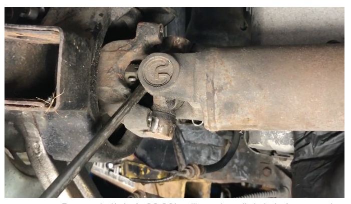
Remove half shaft, 80-82's will require a little help from a prybar

9) Disconnect the half shaft, both inboard and outboard. By removing the whole shaft from the car it will make the work a little easier.